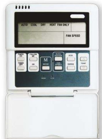
Optional wired controller